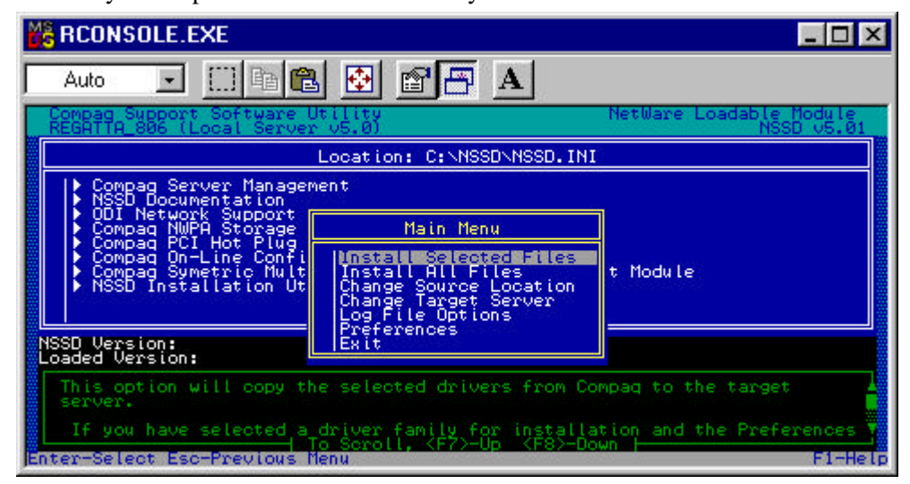
Figure 1 - Compaq Support Software Utility

The Assisted Integration path, however, guides you through the entire process of configuring your hardware and installing NetWare. SmartStart automatically installs the optimized drivers and utilities that support Compaq hardware running NetWare 5. However, with an existing NetWare 5 server, you can install Compaq Support Software for Novell Products (NSSD) via the Compaq Support Software Utility. This utility, which facilitates installation of Compaq drivers and utilities, can be loaded from the command prompt or via Product Options of NWCONFIG, the utility that replaces the INSTALL utility in NetWare 4.x.