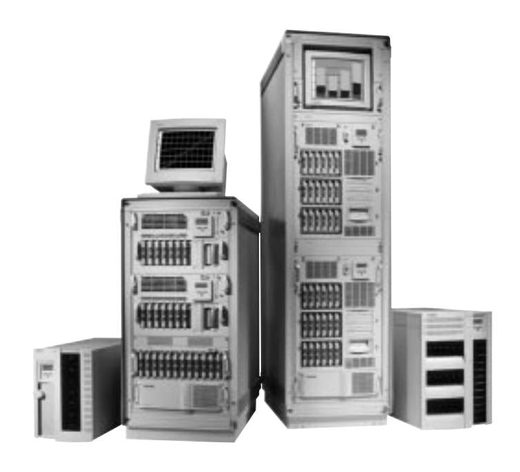
ProLiant 6000/6500/7000 Servers

All claims for both programs must be received at PowerRewards Program Headquarters no later than July 15, 1998. Please refer to Promotion Number SE001 when completing the PowerRewards Sales Claims Form.