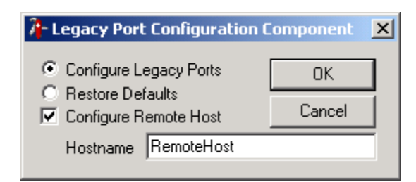
Table 2: CpqLpcc.exe screenshot