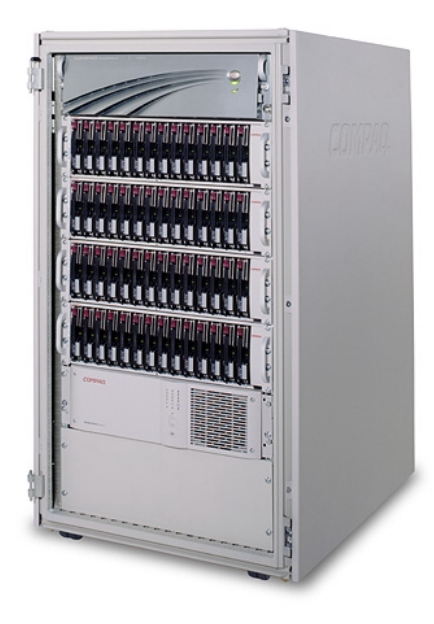
Figure 1: Compaq TaskSmart N-Series appliance

The TaskSmart N-Series appliance is designed as a complete engineered storage solution for a network. The appliance uses an advanced technology architecture, an optimized and reliable operating system, and integrated software components in a fully certified and tested solution. The TaskSmart N-Series appliance enables companies to realize the benefits of storage consolidation and heterogeneous file serving in an easy-to-deploy, easy-to-manage file serving device.