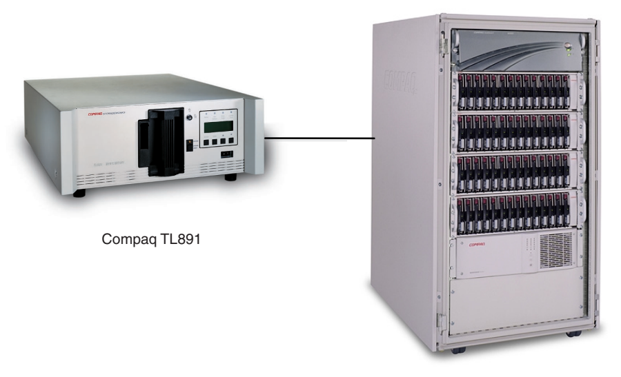
Compaq TaskSmart N-Series Appliance