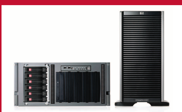
HP StorageWorks 600 All-in-One Storage System