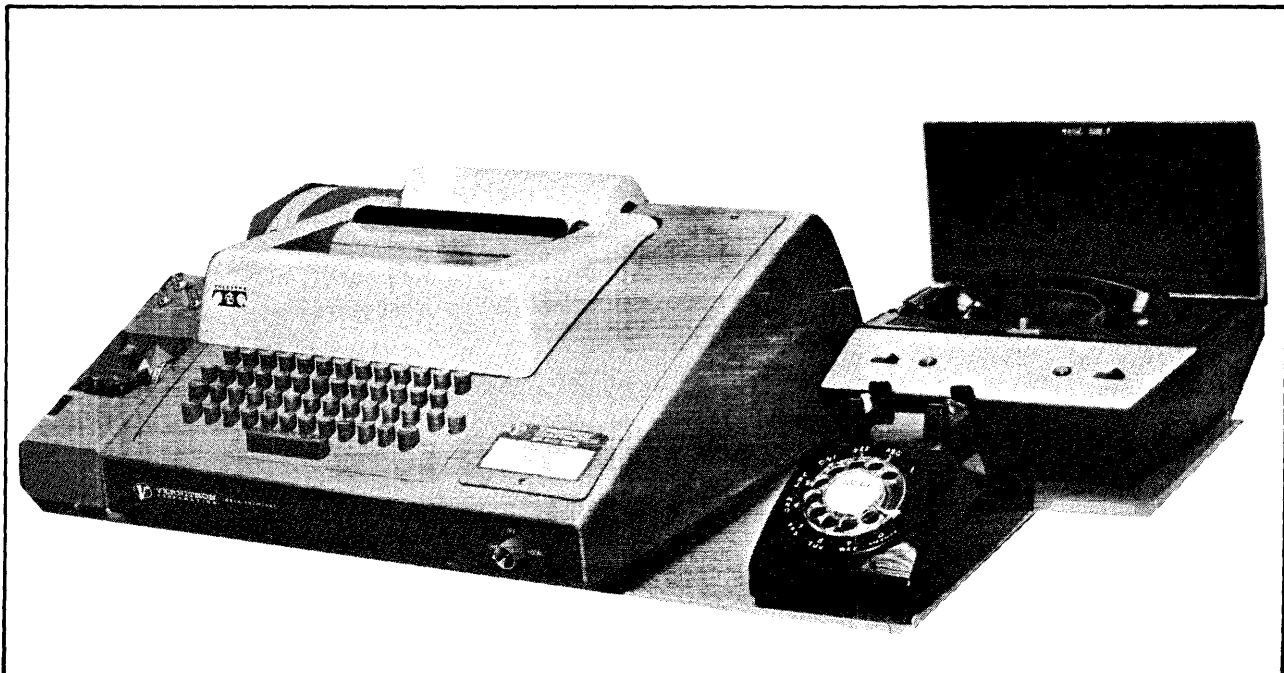
Figure 2. Typical Dialing Unit

Upon receipt of the message LOGON PLEASE:, enter your account, name, and password, in that order, separated by commas. The password and preceding comma are omitted if no password has been assigned.