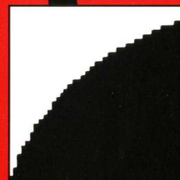
Characters created with digital bit-maps often show jagged, stair-step edges.