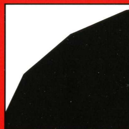
Ordinary imaging systems use vectored type designs that define curves as points connected by straight lines. As a result, edges of larger characters may show facets instead of a true curve.

For more about ways to add this new output capability to your production environment, call your local Compugraphic representative.