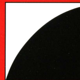
The curvilinear type designs used in the 9600 create type characters with smoother edges, sharper corners, and straighter lines than characters produced by any other imaging technology.