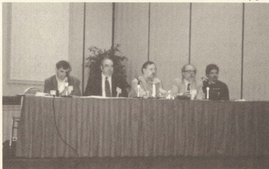
HOPL-II Panel: A. Colmerauer, W. Whitaker, D. Richie, N. Wirth, and A. Kay