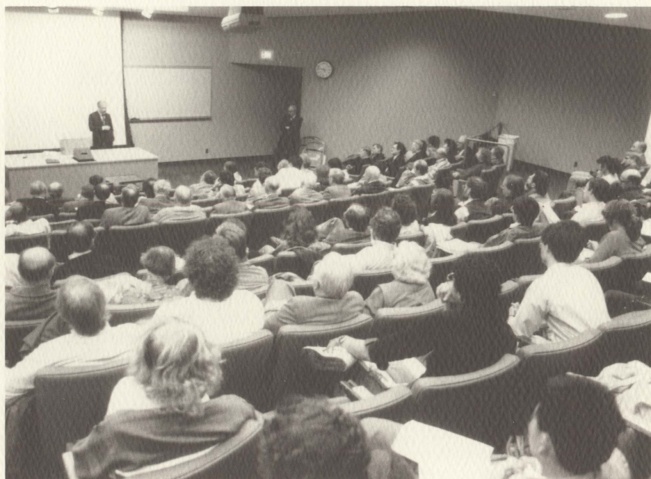
Second Charles Babbage Foundation Lecture, 16 October 1989, University of Minnesota