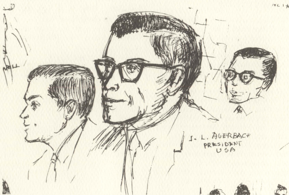
A sketch of Isaac Auerbach, then president of the International Federation for Information Processing, during a September 1963 council meeting in Golå, Norway. The sketches of the council were made by Doreen Utman.

The records are currently being processed and a preliminary inventory of the collection should be available by the end of 1989. Questions about the Auerbach papers should be directed to the CBI archivist. □